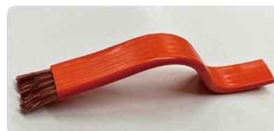
e.g. Put twisted conductors in low area