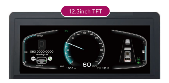
Basic specification TFT display (Speed meter, Fuel, Warning lamps etc.)

• Displaying graphical ADAS functions and support cyber security