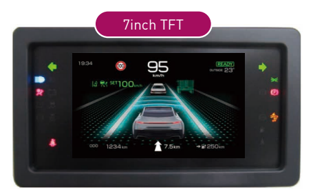
Basic specification TFT display (Speed meter, Tachograph, Temp., Fuel etc.) Warning lamps