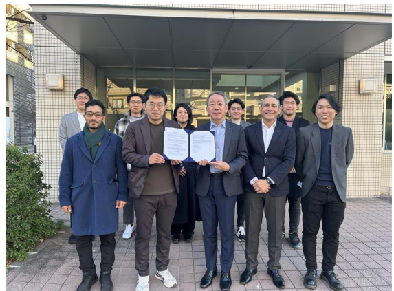
Members of YNA and TOWING