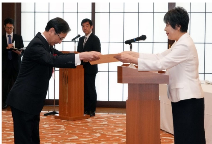
Award Ceremony